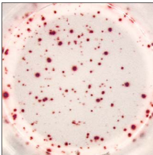
Stimulus: PMA/ionomycin ( 2 \times 10^5 cells/well)

Example of IL-4 specific spots produced by mouse (Balb/c) splenocytes. Preincubation: 42h, incubation ELISPOT: 20h.