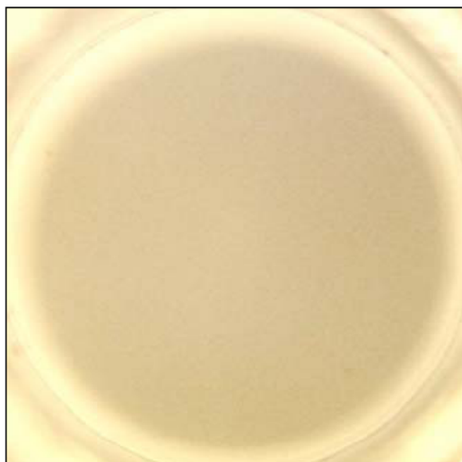
Stimulus: none ( 2 \times 10^5 cells/well)